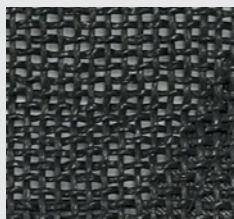
Super Tough Mesh