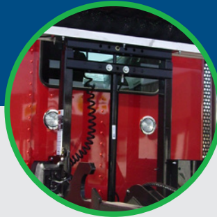
Tower & Integrated Housing