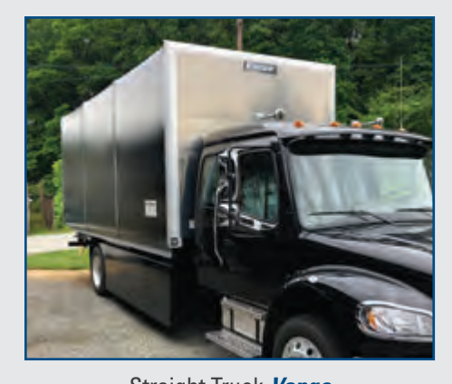
Straight Truck Vango