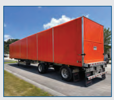
Make your Vango stand out with color!