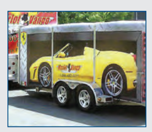
Vango on a Car Hauler