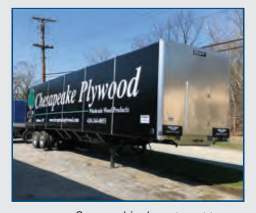
Our graphic department turns your Vango into a moving billboard!